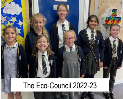
The Eco-Council 2022-23