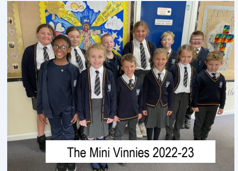
The Mini Vinnies 2022-23